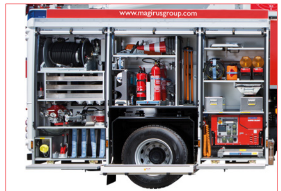
Equipment (exemplary loading)