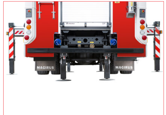
6-way jacking system