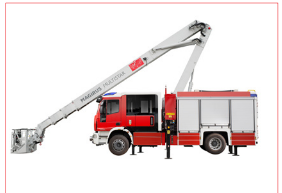
Telescopic boom with operating range from -12 m bis + 30,5 m

Illustrations may include additional options. We reserve the right to make technical changes or improvements at any time without prior notice. Errors and omissions excepted.